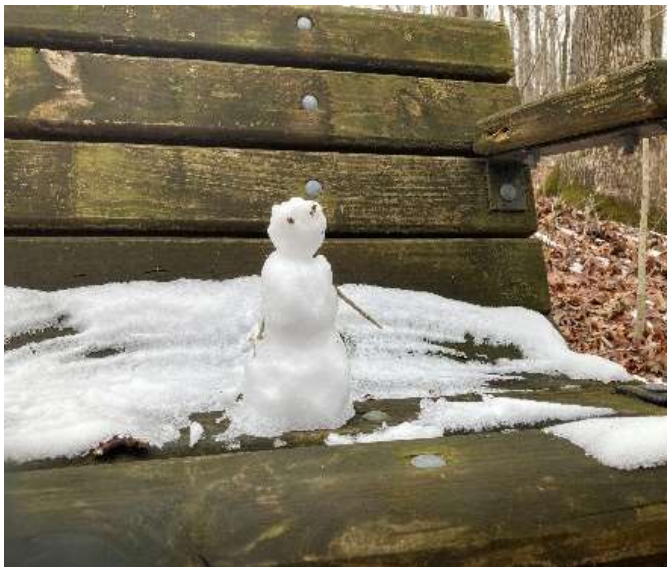
Park visitor taking a rest on the trail