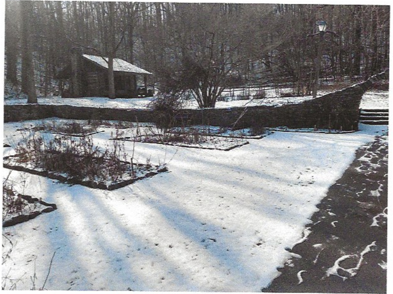
Scenes from the January, 2019 snowfall at Spring Mill State Park

Dues can be sent to: Friends of Spring Mill C/O Spring Mill State Park P.O. Box 376 3333 State Rd 60 East Mitchell, IN 47446