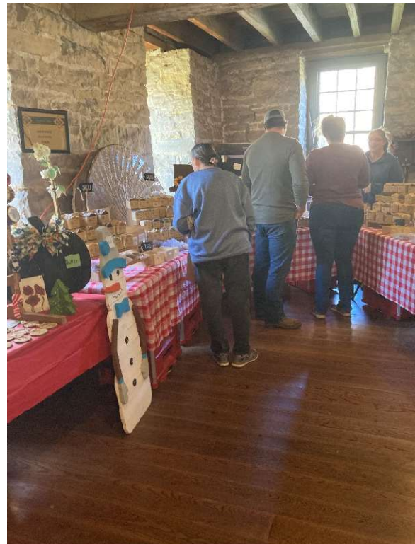
Vendor located in the Mill

Thanks to everyone who helped with the Craft Fair! The Friends were able to add $5700 to their account by holding this event! We are very thankful for the great teamwork between The Lawrence County Tourism Office, the Spring Mill State Park Staff, and Friends volunteers plus amazing weather. People who attended the event found it very enjoyable and helped a lot of them get started on their Christmas shopping. We got a lot of great comments on the event and have ideas to improve it in 2024!