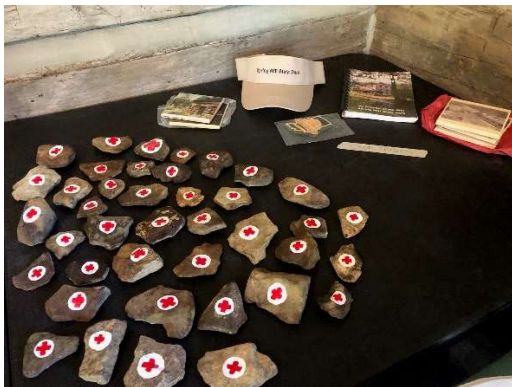
Red Cross Cabin Rocks from Business After Hours Event