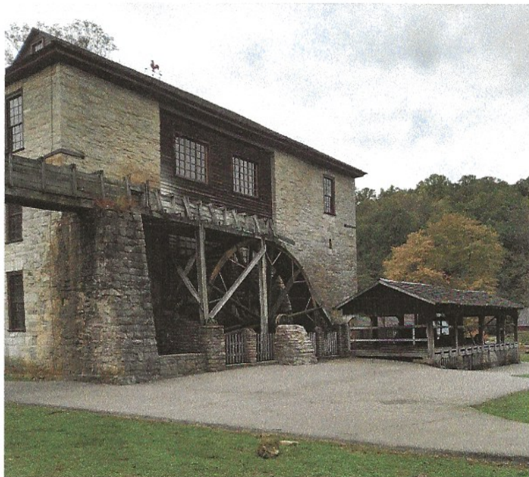
Leaves starting to change colors near the mill.

A trash pickup day was held on Saturday, October 20. Pictured below are some of the members who helped standing next to the Adopt A Highway sign on Highway 60.