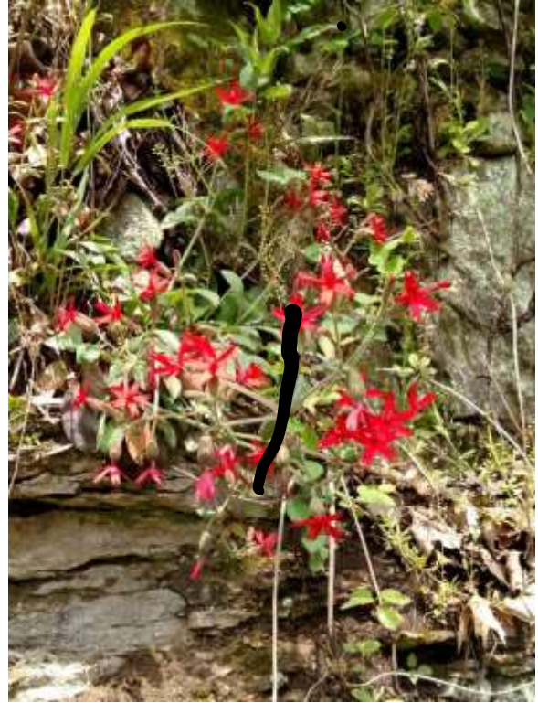
Fire Pinks along rock wall in park.