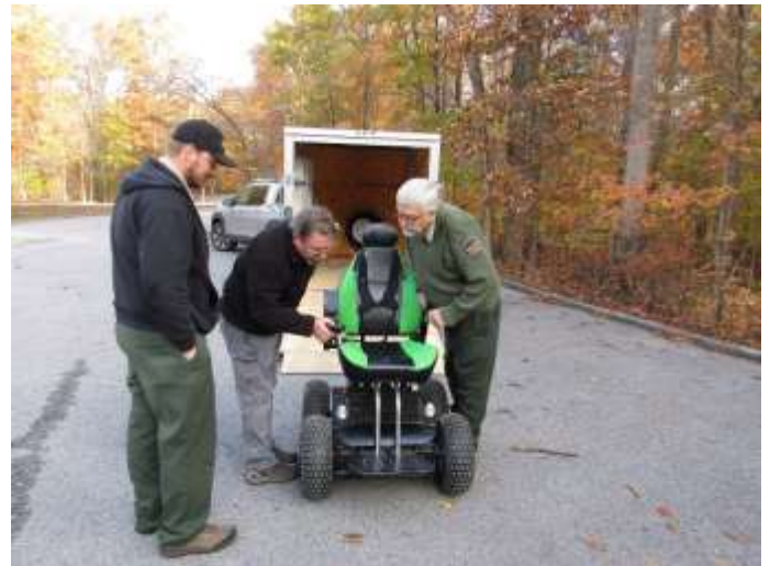
Checking out the All-terrain wheelchair

Due to the rugged terrain, and steps on many of the trails, the all-terrain wheelchair is available for use on Trail 1 up to the Alexander Wilson Monument, and Trail 7. Please contact the office at 812-849-3534 if you are interested in using the all-terrain wheelchair. The Friends were proud of the role they played in helping get this amazing asset for the Park and making some of the trails more accessible to all.