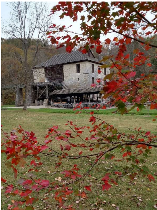
View of the Mill in late October through the trees in the village.

Spring Mill State Park is beautiful in the fall months. And also very busy! In spite of many traditional activities being cancelled due to the Coronavirus, the park still had many visitors throughout the fall months. From trail hiking to paddling on the lake to camping in the campground, many people were able to enjoy the beauty that is Spring Mill.