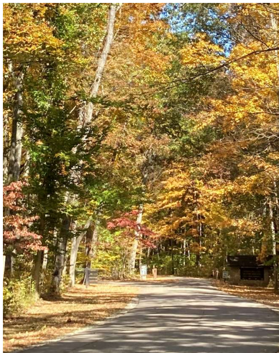
The main road in the park on a beautiful fall day!

Hoping everyone has a great Thanksgiving Holiday!